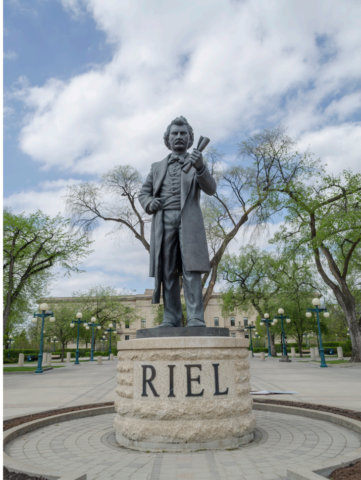
Figure 5.1: Photo courtesy of Wikipedia, same as everything else here.